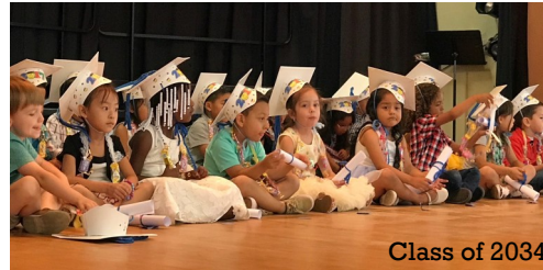
Class of 2034

Hispanic 57% Asian 15% Caucasian 15% African American 9%