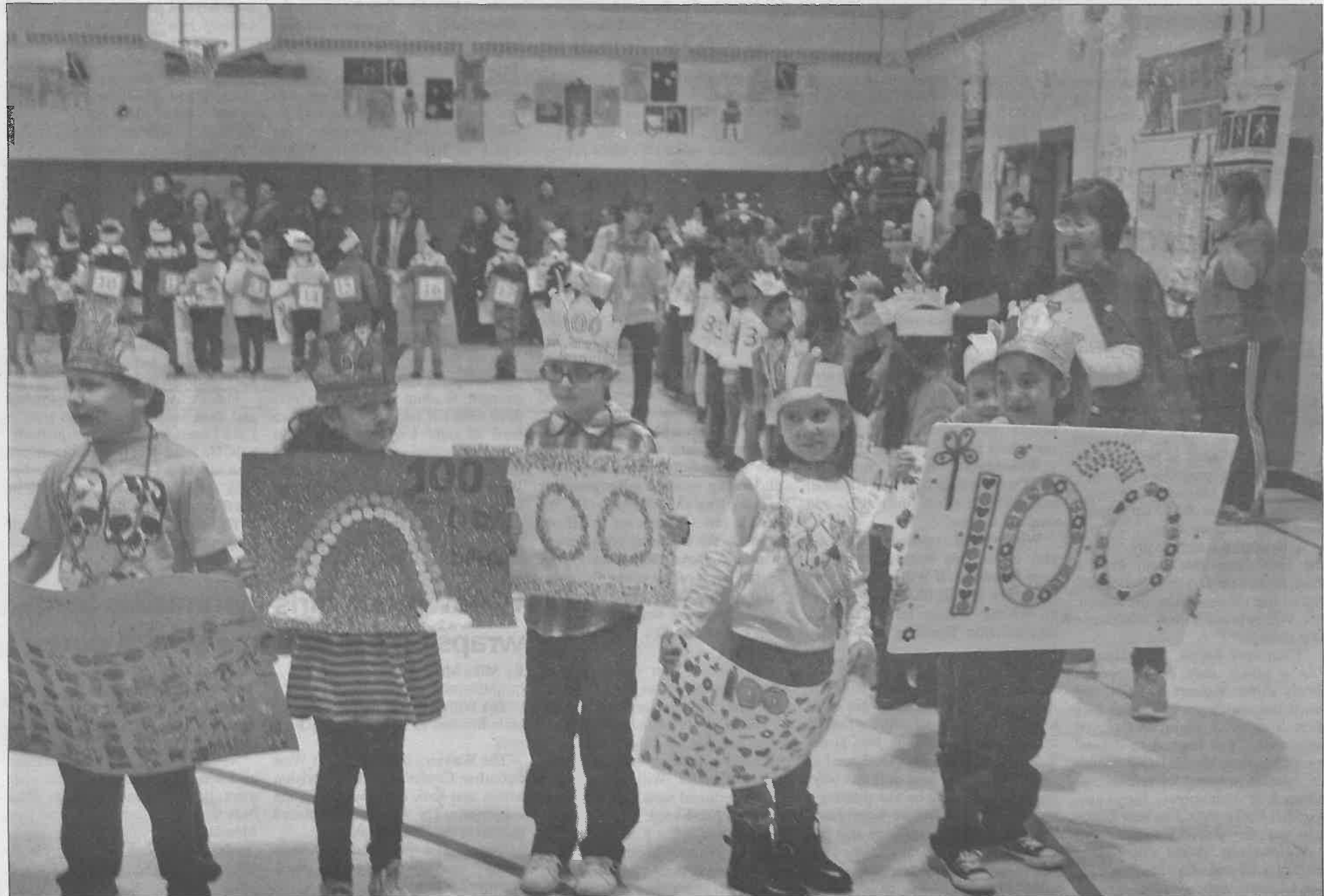
Dressed up themselves, these Fullerton first graders carried posters into the gym at the end of their parade through the hallways of the to celebrate the 100th Day of School. The day had to be postponed a few days, due to the recent snow days!