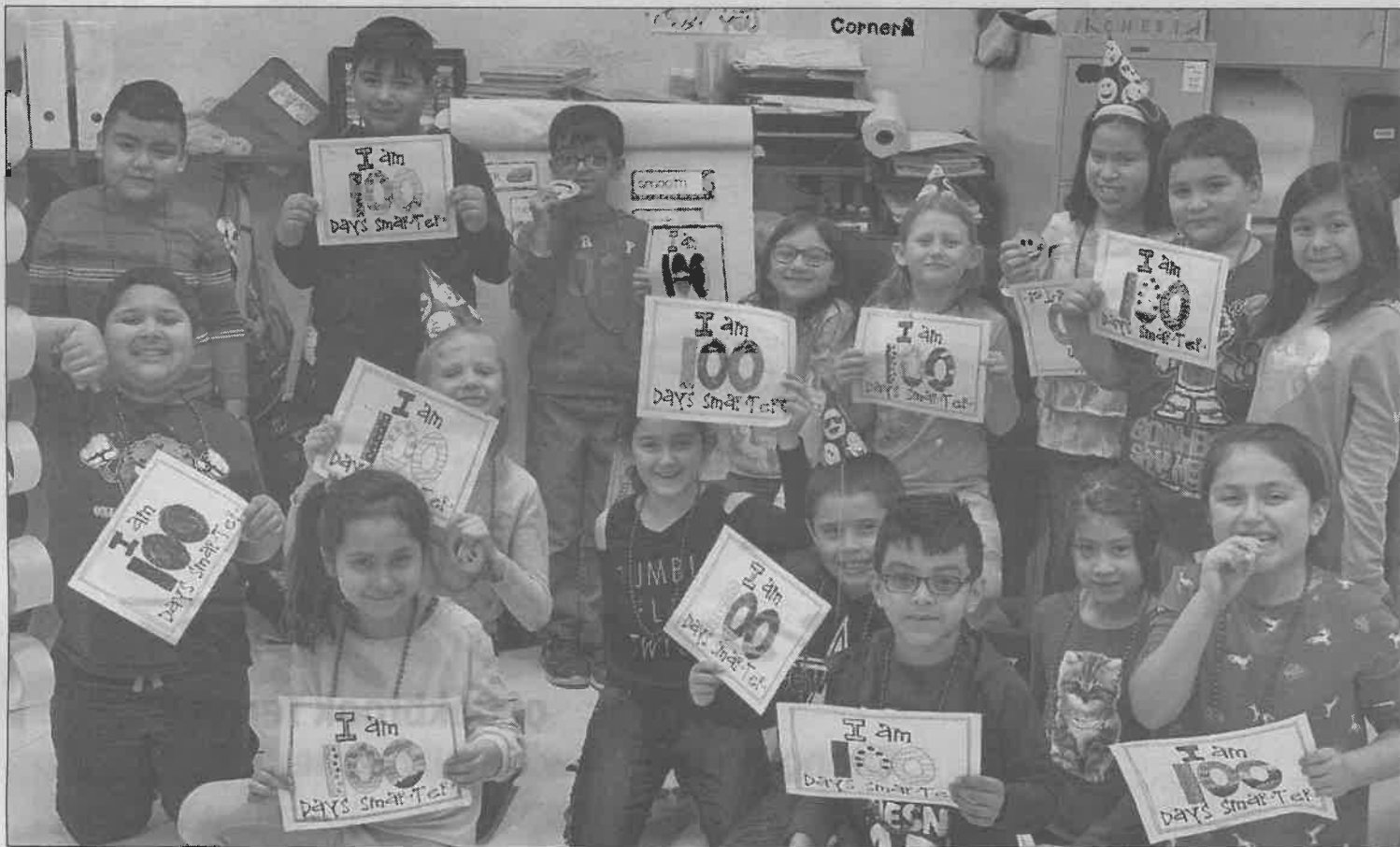
SUBMITTED PHOTO Addison Independent