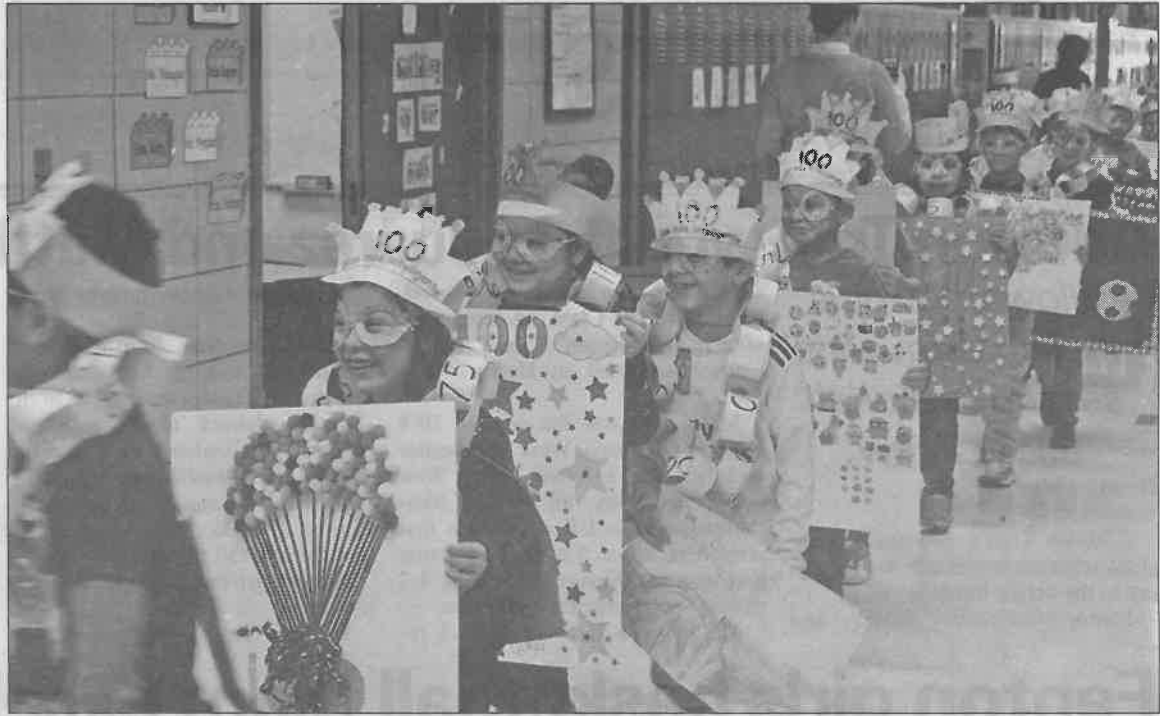
Fullerton School 1st graders who paraded through the school, carrying posters, wearing 100 Day hats, paper chains, and glasses, and chanting "Hip, hip, hooray, it's our 100th day!" In the gym, the students counted off to 100, while family members observed and snapped pictures.