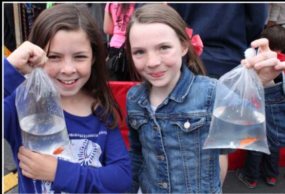
Last chance for goldfish!

Our 71st year! Come celebrate our diversity!