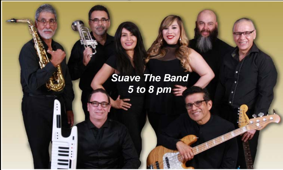
Suave The Band 5 to 8 pm