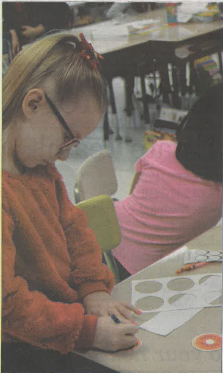
This second grader prepares a donut as part of an exercise that illustrates mass production of goods.