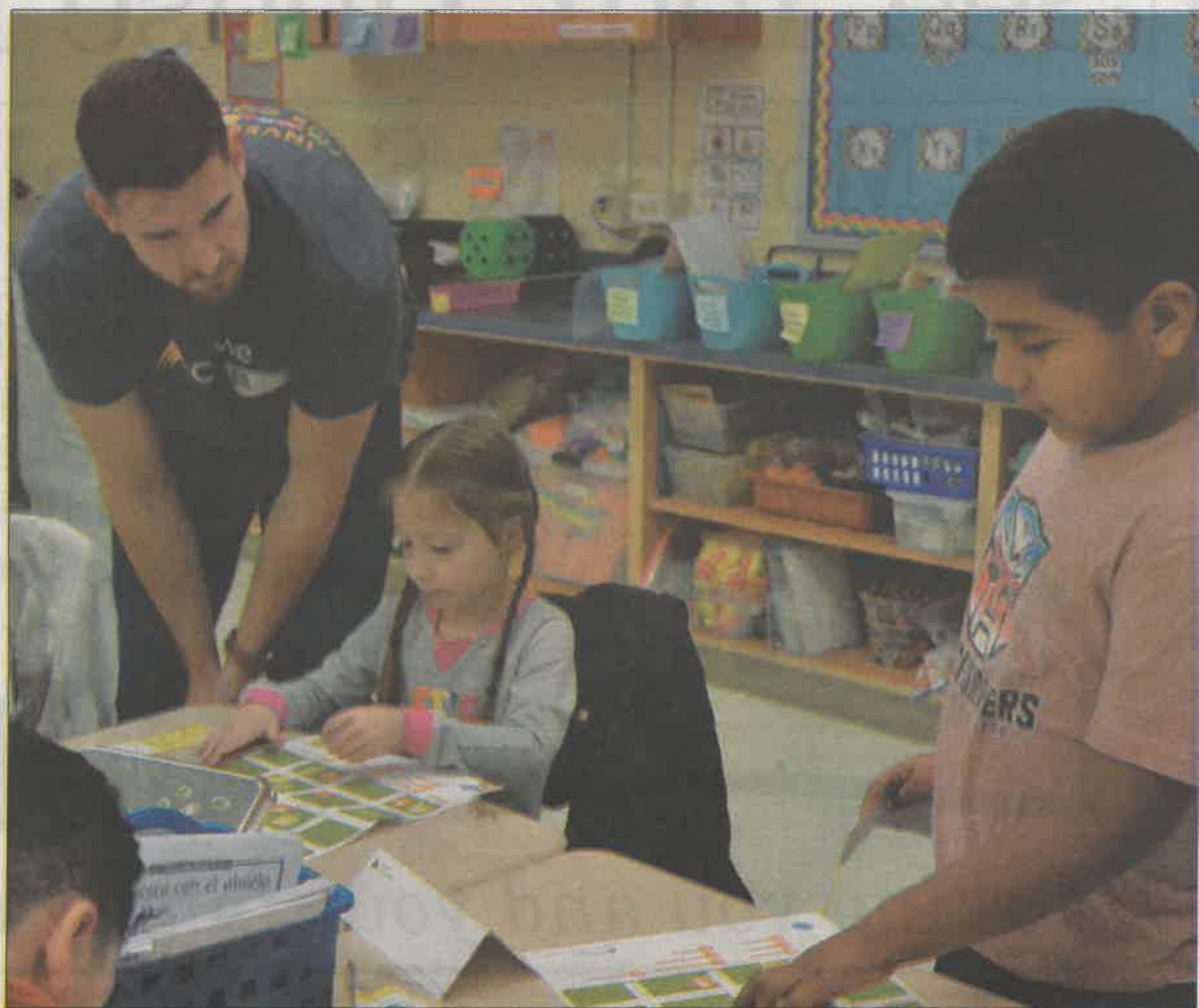
First grade Wesley students putting stickers on a map of their neighborhood.