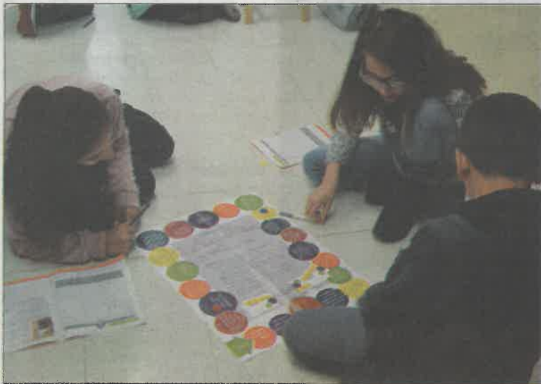
These fifth graders at Wesley School play the 'Get the Job' game.