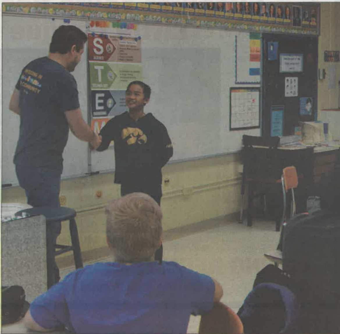
A Crowe volunteer and a Wesley fifth grader demonstrate a simple job interview. After that, students practiced introducing themselves and giving handshakes to one another.

131 Crowe LLP employees worked with 1351 students in 74 classrooms in five DuPage County schools, three of which were in Addison. The grade-specific programs--titled Our Families (1st grade), Our Community (2nd grade), Our City (3rd grade), Our Region (4th grade), and Our Nation (5th grade)--help volunteers introduce students to age-appropriate economics concepts through a variety of activities.